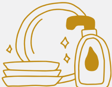
ENHANCED RESTAURANT PROCEDURES P. 59