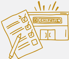
RESTAURANT INSPECTIONS P. 61