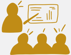
ADVISORY COUNCIL P. 63