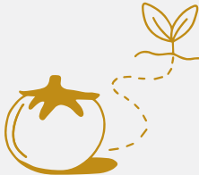
INGREDIENT TRACEABILITY P. 62