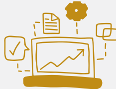
ADVANCED TECHNOLOGY P. 58