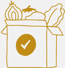
FOOD SAFETY CERTIFICATION P. 60